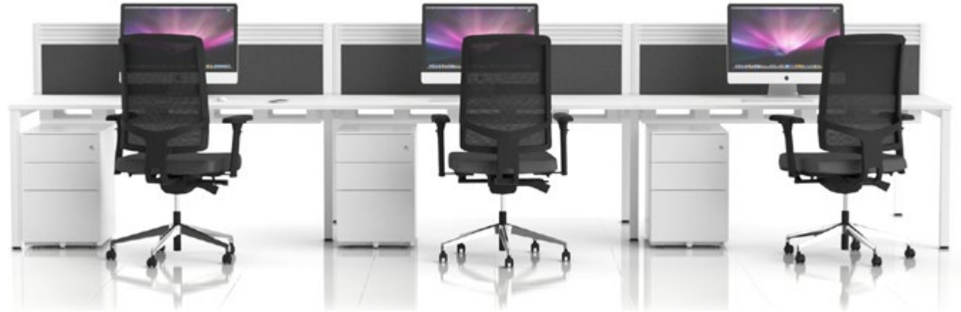
Flexible work patterns

Relay provides a durable and functional solution for every working environment.