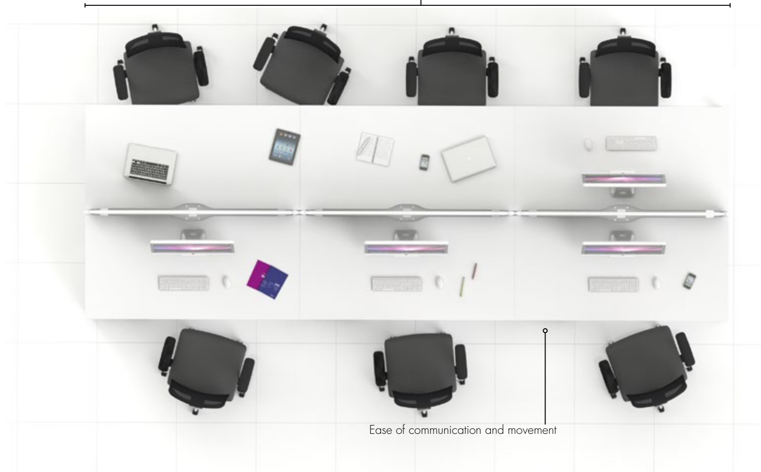
Ease of communication and movement